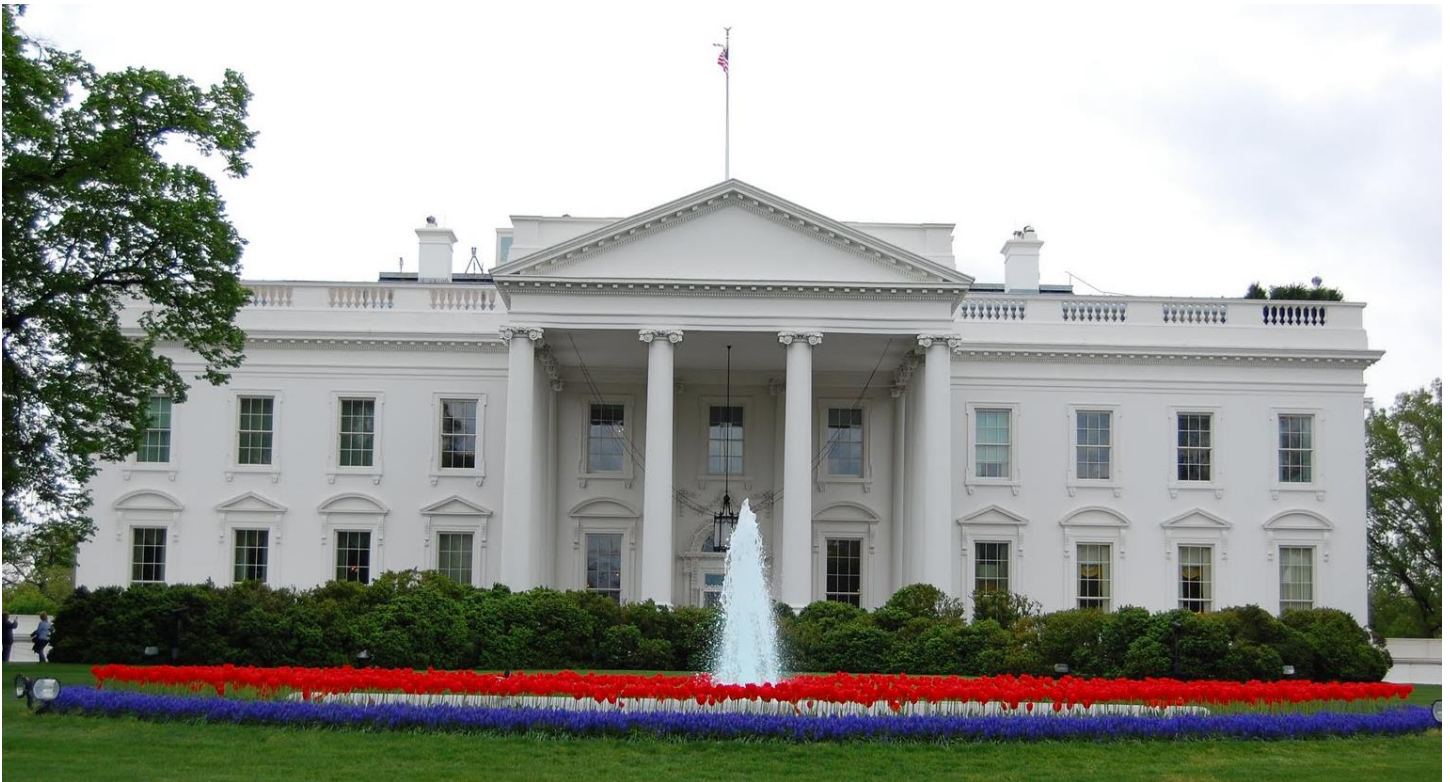
Caption: Above is a picture of the White House located in Washington D.C.

Carefully examine the image and read the caption. Then discuss how the achievements the ancient Greeks made in the field of architecture affects our modern life with your partner and record your answers in your packet.