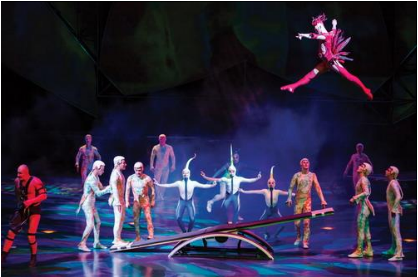
Caption: The picture above shows members of Cirque du Soleil using leverage to launch each other into the air in one of their performances.

Carefully examine the image and read the caption. Then discuss how the achievements the ancient Greeks made in the field of engineering affects our modern life with your partner and record your answers in your packet.