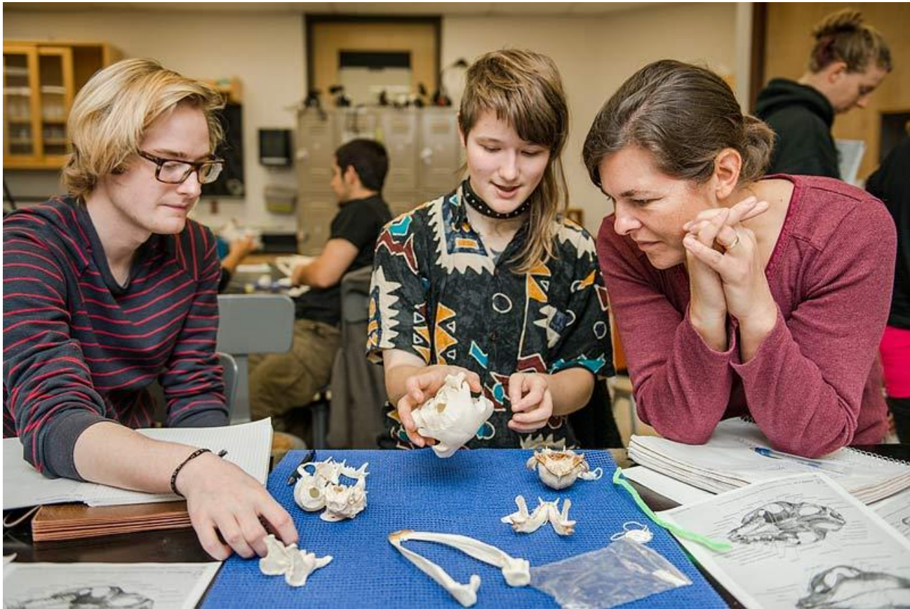
Caption: Above is a picture of zoologists comparing the skeletons of different vertebrates.

Carefully examine the image and read the caption. Then discuss how the achievements the ancient Greeks made in the field of zoology affects our modern life with your partner and record your answers in your packet.