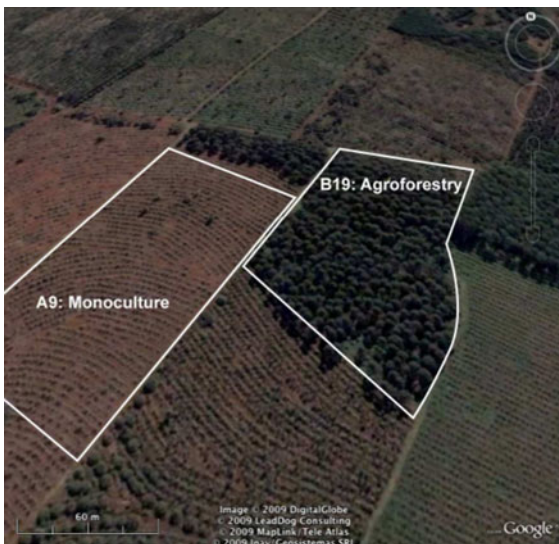
Fig. 1 Satellite imagery obtained from Google Earth of two adjacent study sites

On each plantation, four 10 m 2 circular plots were randomly chosen using unequal probability list sampling. To compare soil nutrient levels across treatments, six soil cores were taken using a 6-cm diameter corer for each of the four plots at two depths, 0–5 cm