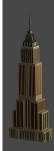
Owen Gonzalez Art Deco