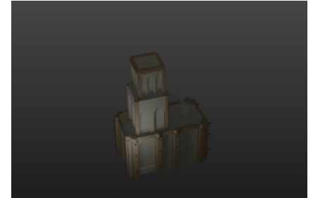
Liam Fuller HERE Gothic

Click on the links below to check out some of these final animated render views!